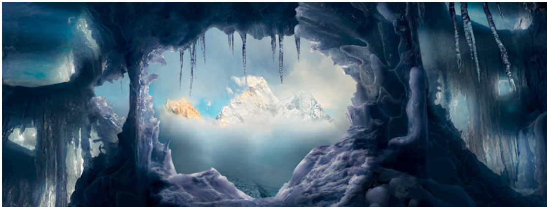
'The Ice Prison', Himalayas - Max Rive

The overall winner of the 2015 Open competition is Max Rive from The Netherlands!